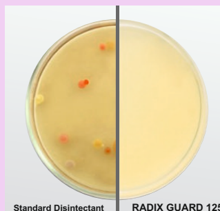
Standard Disinfectant RADIX GUARD 125

With standard disinfectants, as soon as pathogens come into contact with surface, they can immediately contaminate and re-colonize it until the next time the surface is disinfected.