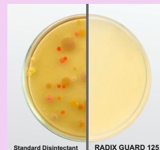
Standard Disinfectant RADIX GUARD 125

RADIX GUARD 125 spray leaves behind a shield that prevents key epidemiologically relevant pathogens from recontaminating and recolonizing the surface for up to 24 hours or 96 touches.