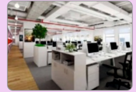
Enterprises and institutions