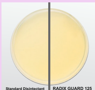
Standard Disinfectant RADIX GUARD 125

Standard disinfectants and RADIX GUARD 125 Spray immediately kill pathogens at point of use.